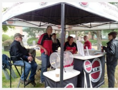
GF Strong Show & Shine 2013