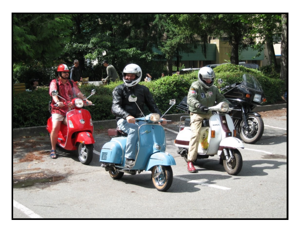
All kinds of Rides!